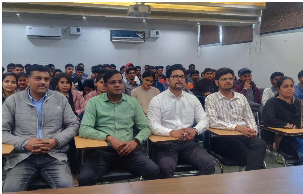
Photo. Guru Daksh Government Polytechnic, Hisar