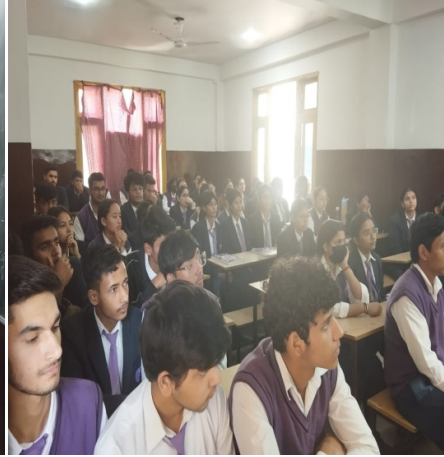
Photographs of School 2: DAV, Mohal, Kullu