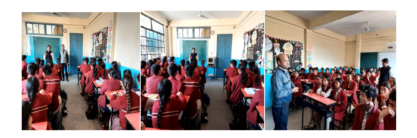
Photographs of School 3: Aagmik Public Sr. Sec. School, Mohal, Kullu