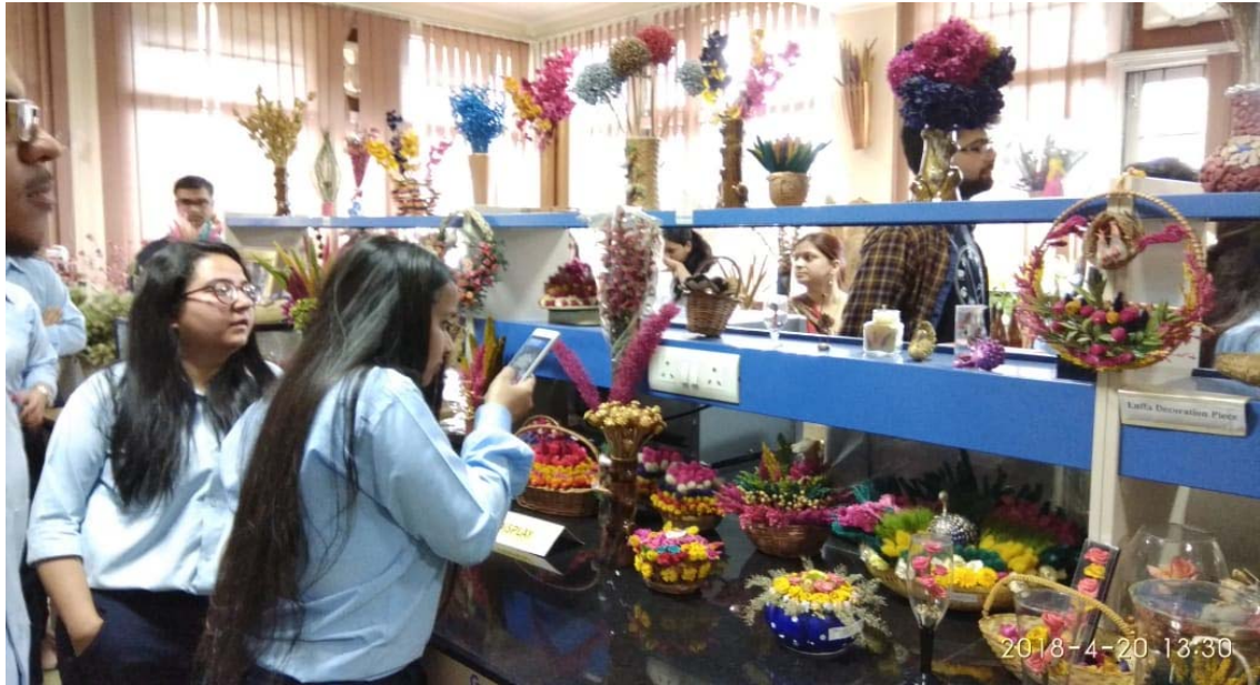
Photo 3: B. Tech 4 th year students in the lab of Floriculture at UHF Nauni Himachal Pradesh.