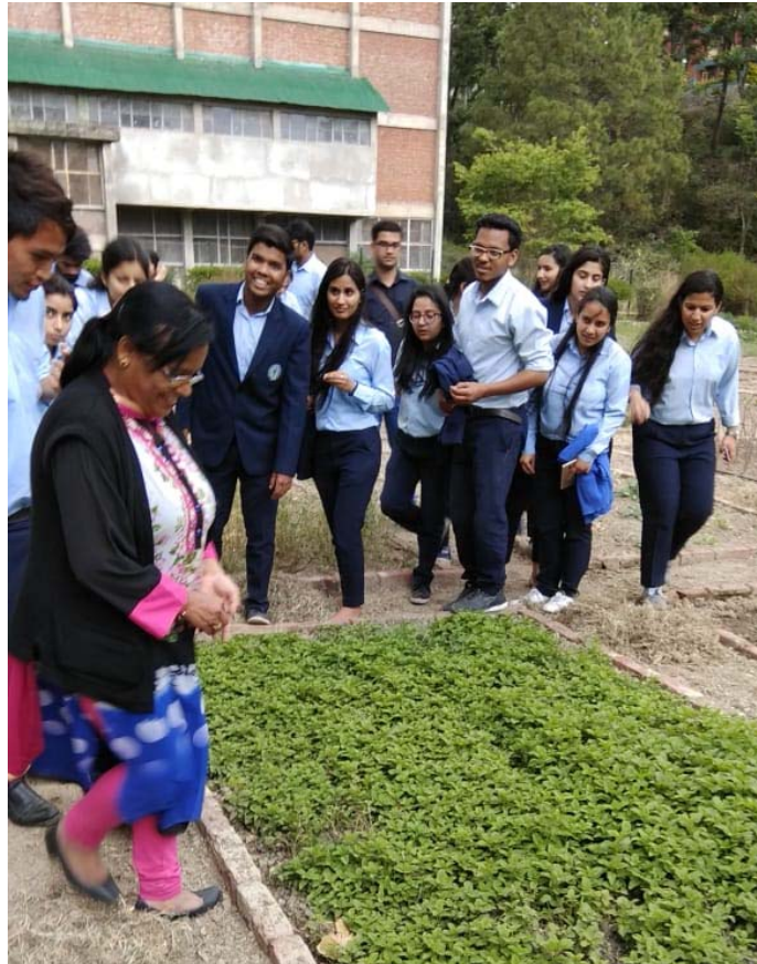
Photo 2: B.Tech 4 th year students in the Medicinal Plant's garden of Forestry department at UHF Nauni Himachal Pradesh.