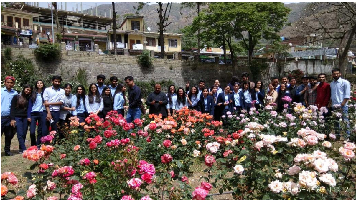
Photo 1: B.tech 4 th year students in the Rose garden of Floriculture department at UHF Nauni Himachal Pradesh.